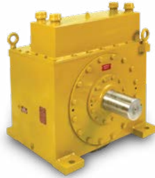
CECON ® Clutches