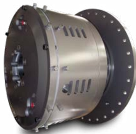
Marine Standard Ventilated Clutches