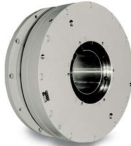
Model HBA Clutch/Brake