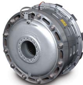
LKB Spring Set Brakes